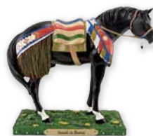
Stands in Beauty