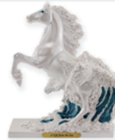
A Gift from the Sea