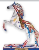
Spirit of Freedom