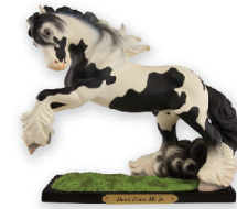
Don't Fence Me In