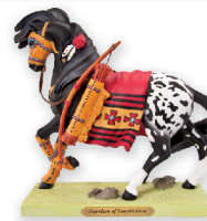
Guardian of Sunset's Gate