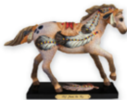
Gift from the Sky