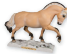
Little Big Horse