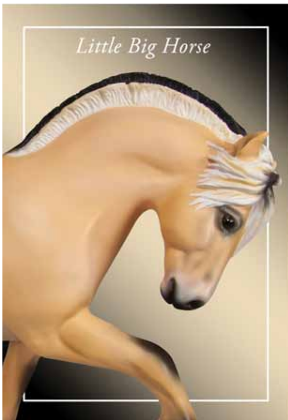
Little Big Horse