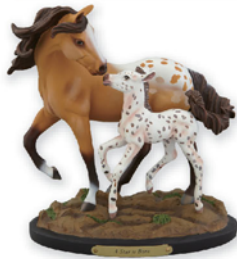
A Star is Born