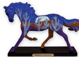
Sundown to Moonrise